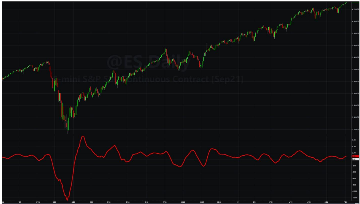
Figure 3. The MAD (Moving Average Difference) Indicator Displays the Trend as an Oscillator Scaled as a Percentage of Price