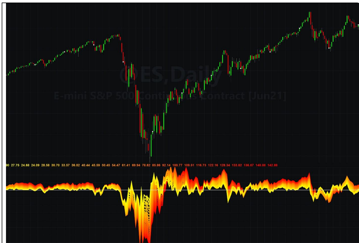
Figure 2. The Cycle/Trend Analytic Shows the Strength of the Trend as the Width of the Displays and the High Frequency Content is Similar for All Indicators

So there you have it. Although the derivation is convoluted, the MAD (Moving Average Difference) Indicator is basically just the difference of two simple moving averages whose averaging lengths are different by approximately half the period of the dominant cycle in the data. The indicator becomes smoother as the length of the shorter moving average is increased. The length of the longer moving average should be the length of the shorter one plus half the period of the dominant cycle in the data. If the dominant cycle is unknown, just make the length of the longer moving average be twice the length of the shorter one. As a difference of moving averages, the MAD Indicator is a thinking man's MACD because there is a rationale to establish the lengths of the moving averages. Further, simple moving averages have a linear phase response so that the differencing obviates the need for a third smoothing average.